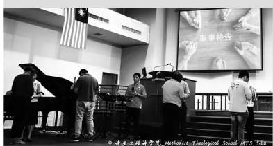
11 July: MTS was invited to lead the prayer meeting at Hwai Ang Methodist Church.