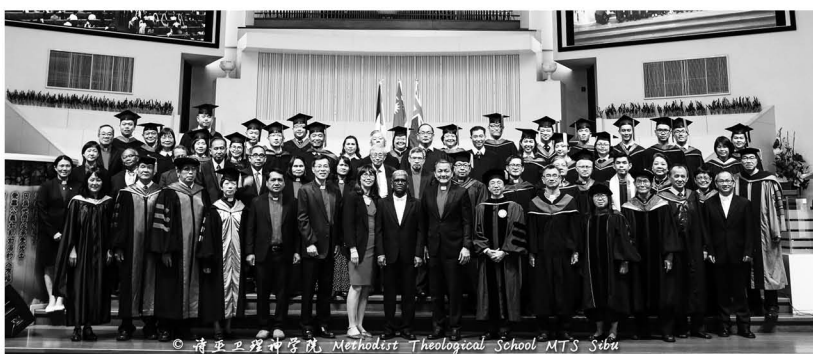
26 Oct: 21st Graduation Service (since its reopening of Degree Courses), 9am at Masland Methodist Church, Sibü.