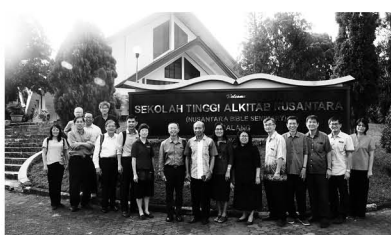
9-15 Aug: Faculty Educational Tour and Retreat in Indonesia.