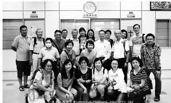
10 Oct: (4.00pm) Delegates from Ta-chih Presbyterian Church, Taiwan.