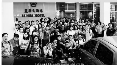
17-18 Jun: MTS Silent Retreat for lecturers & students, 2D1N at Li Hua Hotel, Unicity Sibü.