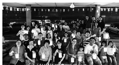
9 Sept: MTS celebrates Mid-Autumn Festival.