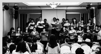
2 Nov: MTS community was invited by Paramount Hotel to participate in their 17th Year End Thanksgiving Service and luncheon.