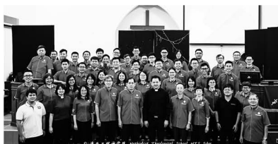
29 Jun: MTS Night (Sarikei), 7.15pm at Methodist Town Church.