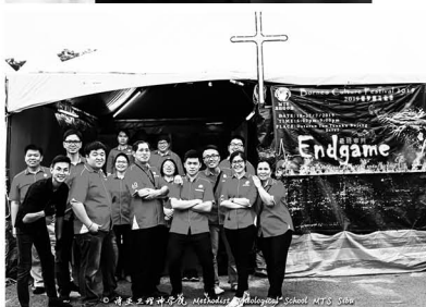
18-27 July: MTS having a booth at the Borneo Cultural Festival with theme "End Game".