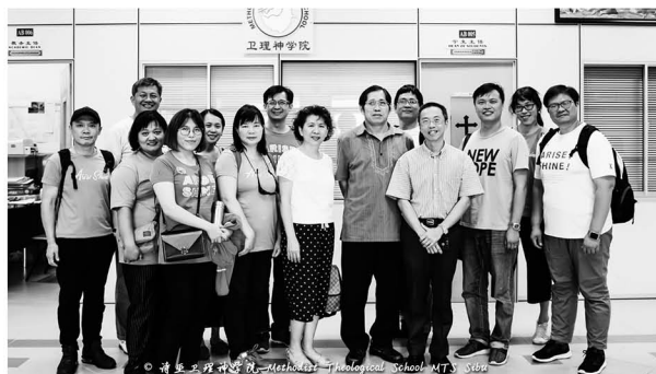
29 Aug: (2.30pm) Delegates from Ling Leung Pastor and Missionary Theological Seminary, Taiwan.