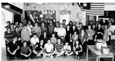
19 July: MTS Family Dinner (Parents' Day & Birthday Celebrations).