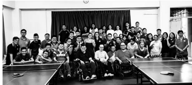
10 & 17 July: MTS Recreation Committee organized a table tennis game with Sibü Spinal Cord Injury Association.