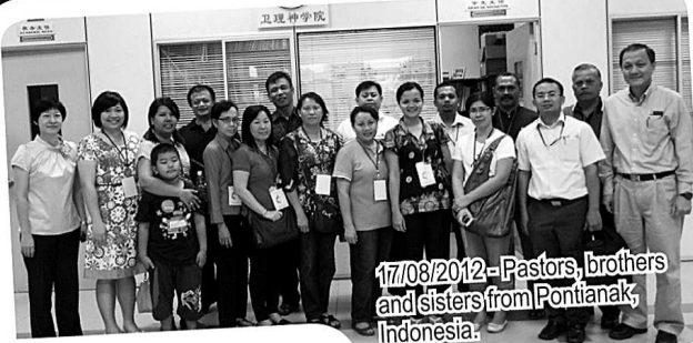
17/08/2012 - Pastors, brothers and sisters from Pontianak, Indonesia.