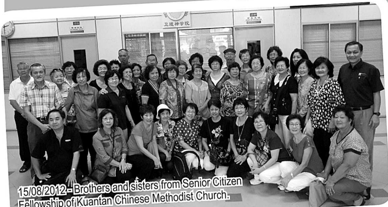
15/08/2012 - Brothers and sisters from Senior Citizen Fellowship of Kuantan Chinese Methodist Church.