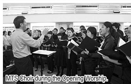
MTS Choir during the Opening Worship.