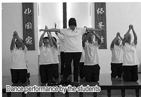
Dance performance by the students

MTS held the second MTS Night of the year at Kai Nguong Methodist Church, Bintangor, on 28th July, 2012. All the lecturers and students (including Iban lecturers and students) took part in the event.