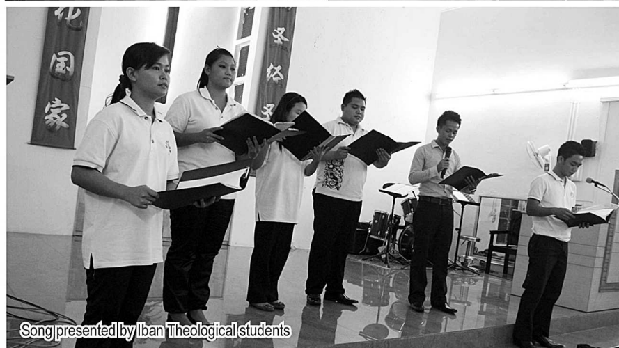
Song presented by Iban Theological students