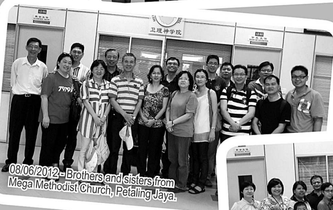
08/06/2012 - Brothers and sisters from Mega Methodist Church, Petaling Jaya.