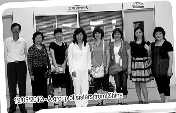
19/05/2012 - A group of sisters from China