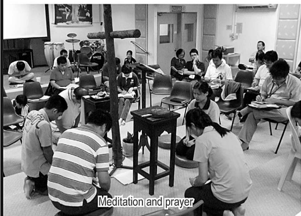
Meditation and prayer

Before the mid term break, the whole MTS community took part in the Community Retreat on 20th – 21st August, which was held in the school campus. This was the first time for MTS to host a retreat involving the whole community, we shared, we meditated, we played game, we watched movie, and we exercised together. This was a wonderful experience for MTS community to get to know each other more.