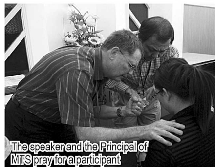
The speaker and the Principal of MTS pray for a participant