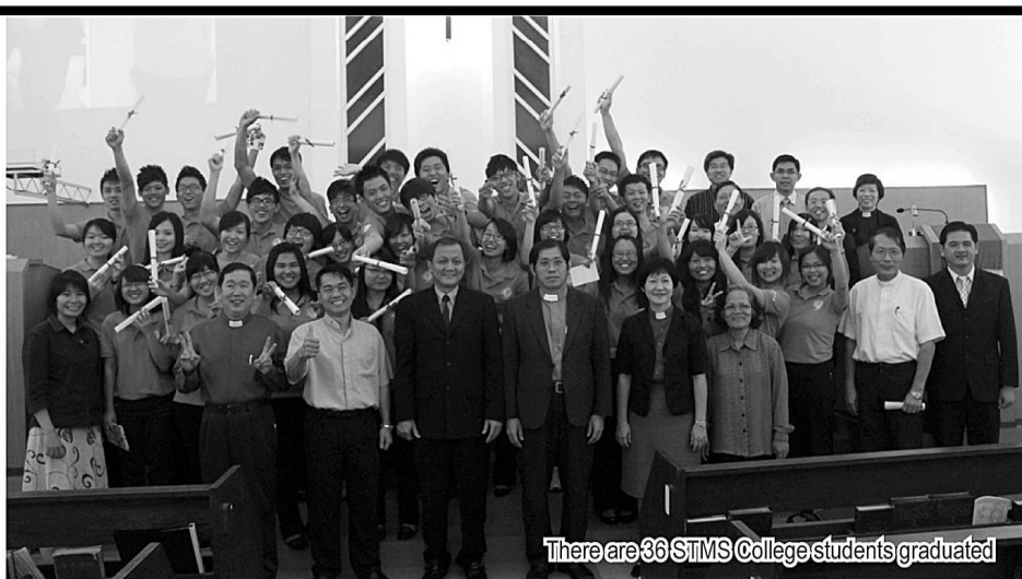
There are 36 STMS College students graduated