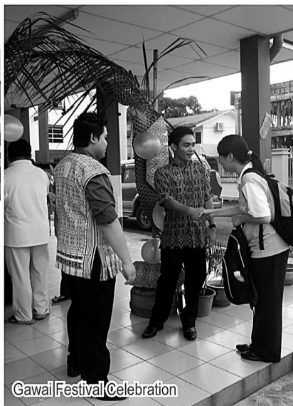
Gawai Festival Celebration