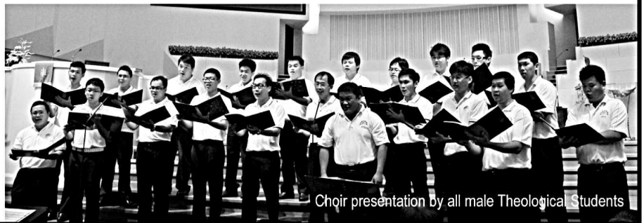
Choir presentation by all male Theological Students