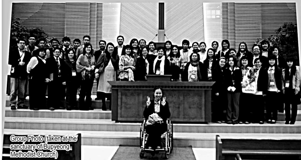
Group Photo (taken at the sanctuary of Bupyeong Methodist Church)

It's such a blessing to join the prayer experience trip to Korea this April. As a student, it is almost financially impossible for me to go to Korea and enjoy such superb food and accommodation as provided by Bupyeong Methodist Church. We understand it's all out of love. They love Jesus so much, thus they provide such excellent hospitality. What impressed me most is the faith of the church members, especially the leaders and sisters. They trust God and believe God always listen to prayers. They love praying and serving others. That's what I think I must learn from them, to believe unwaveringly that God always listen to prayers, to wait for God's timing and to serve others wholeheartedly. As they do so, God bless the church beyond what they expect. Hallelujah! Let us learn from them.