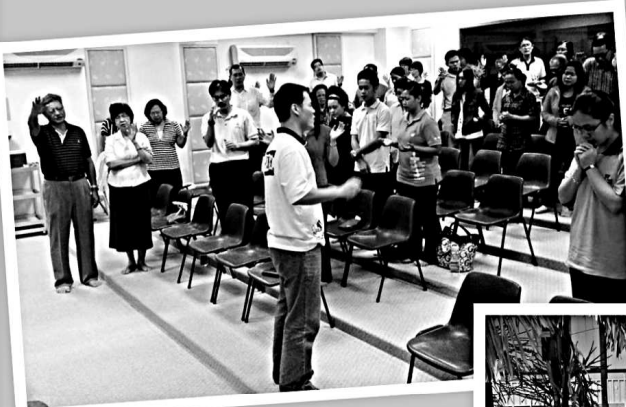
he alumni prayed for the on campus students